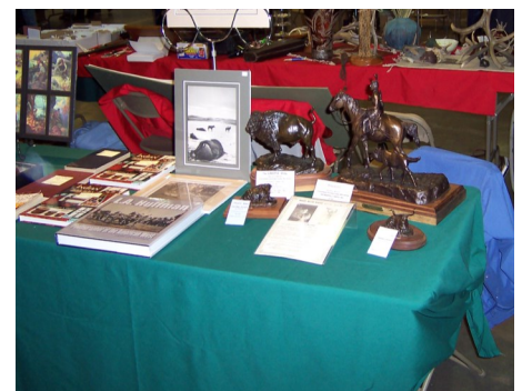
COLLECTIVE BRONZES LITERATURE PRINTS