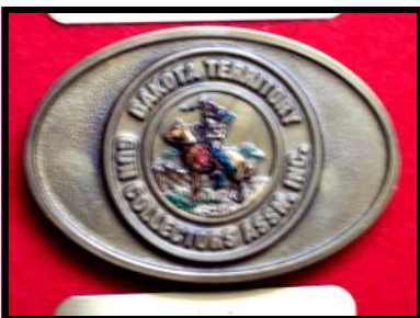
1998 SEVENTH buckle, many metals, brass in color, 325 made