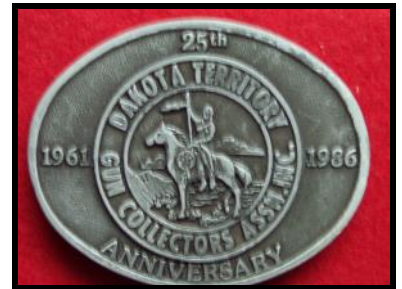
1986 THIRD buckle, 25th anniversary, pewter in metal, oval in shape, 300 made