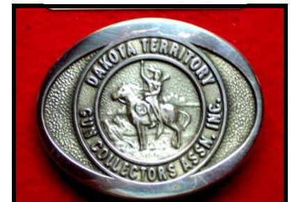
2001 SPECIAL EDITION, NINTH buckle, sterling silver, undated 100 made