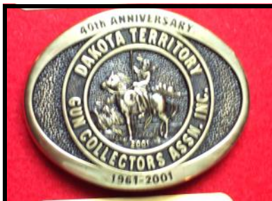
2001 EIGHTH buckle, 40th anniversary, solid brass, 500 made