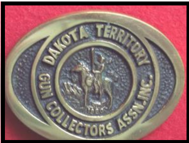
1980 FIRST buckle, good, heavy, solid brass, oval in shape, the preferred one of all the buckles, 300 made