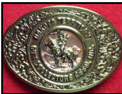
1992 FIFTH buckle, 2 kinds of metal used, brass in color, 250 made