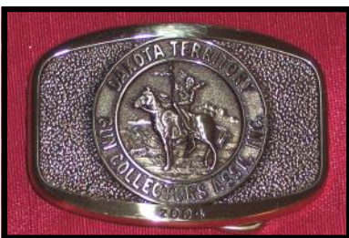
2004 TENTH buckle, solid brass, smallest of all the buckles 250 made