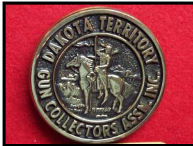
1983 SECOND buckle, good heavy, solid brass, round in shape, 300 made