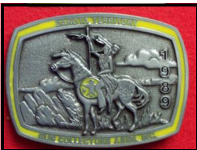
1989 FOURTH buckle, Pewter edged with green, the least preferred of the bunch, 400 made