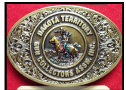
1995 SIXTH buckle, 2 kinds of metal, brass color, larger than the 5th buckle, preferred by many, 325 made